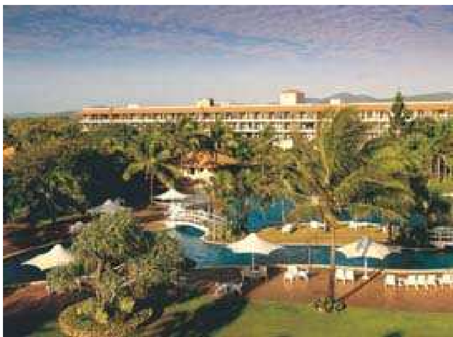
Rydges Capricorn Resort, Yeppoon